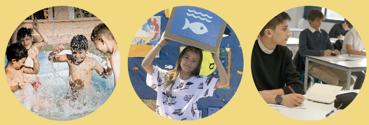
Building a New World 3 to 10 years old

Make new friends and build life skills Friendly environment Technology activities Cinema Room